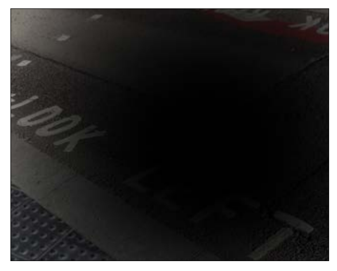
Age-related Macular Degeneration (AMD)